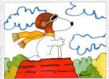
Kiana, Age 7

Location: ST. PATRICK CATHOLIC SCHOOL (Room TBA)